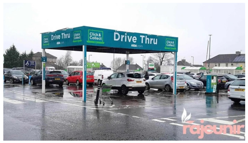
Asda motherwell superstore motherwell