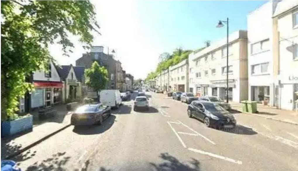
Right medicine pharmacy and travel clinic bridge of allan street view 360deg