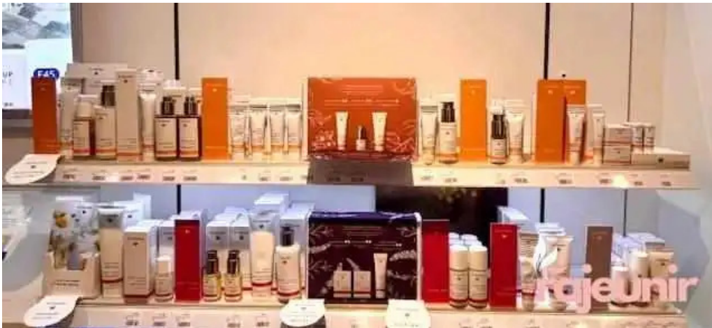
Right medicine pharmacy and travel clinic bridge of allan stirling