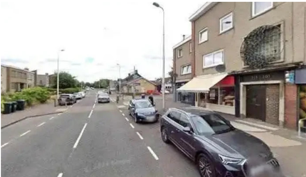
Well pharmacy street view 360deg