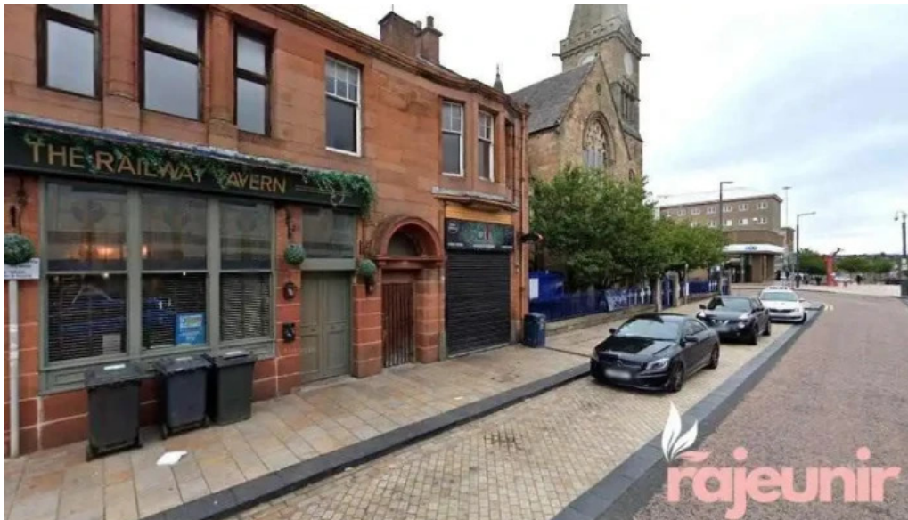
Brandon pharmacy motherwell