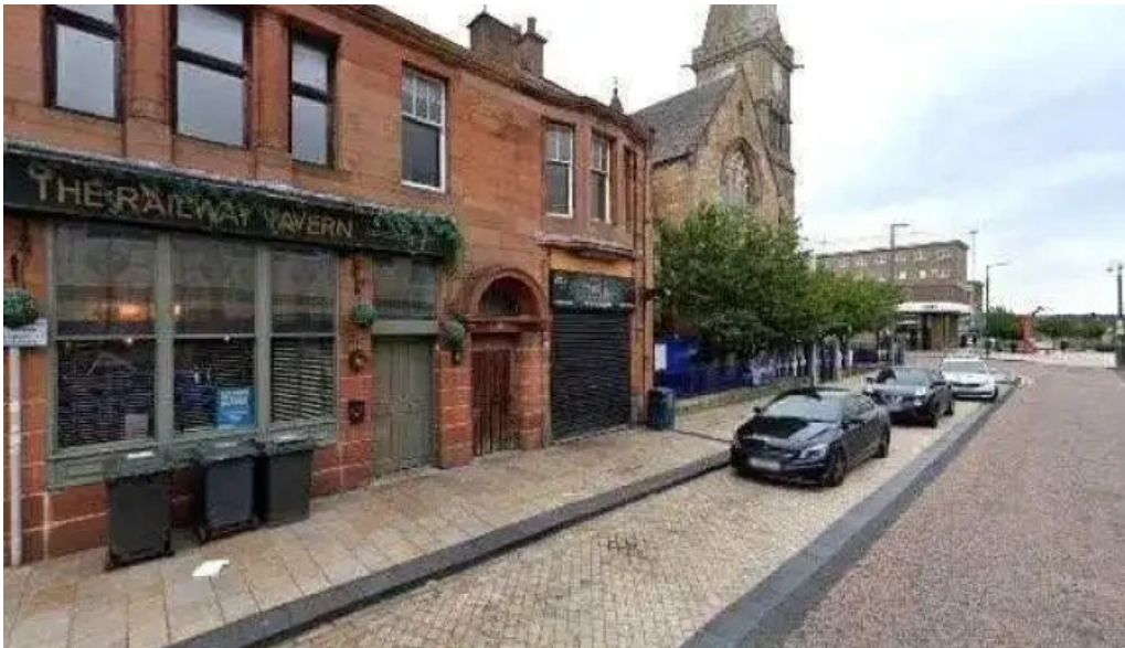
Brandon pharmacy all