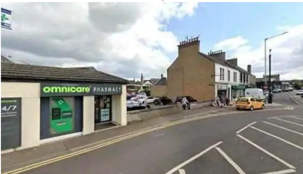
Omnicare pharmacy leven travel clinic street view 360deg