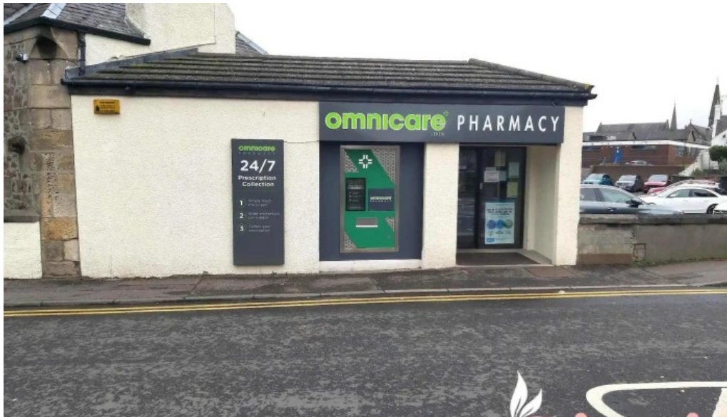
Omnicare pharmacy leven travel clinic all