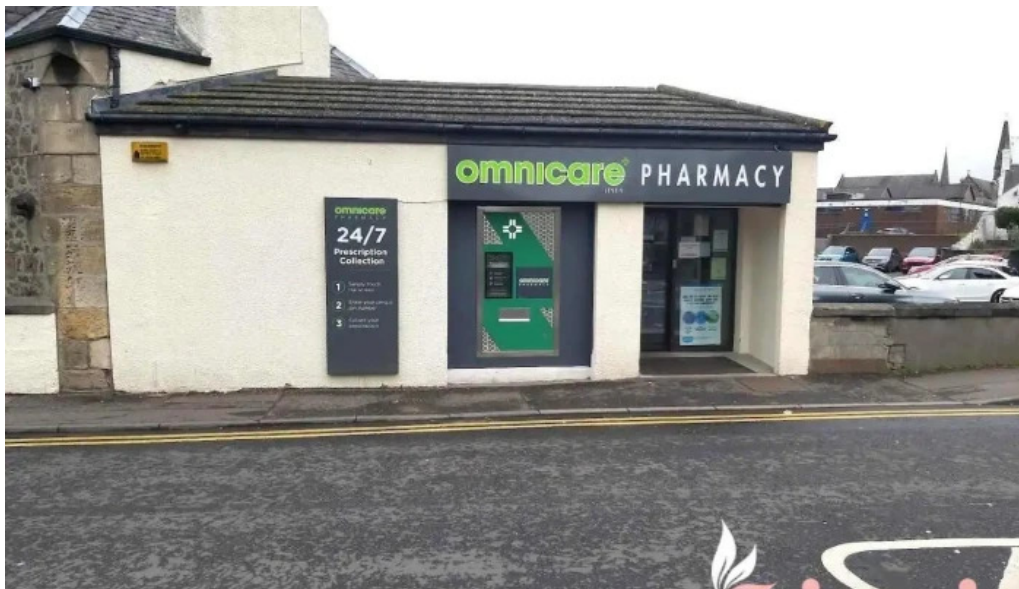
Omnicare pharmacy leven travel clinic leven