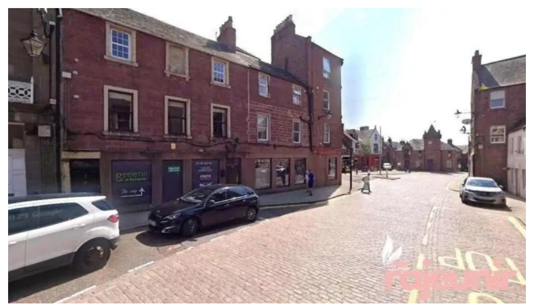
Boots pharmacy kirriemuir