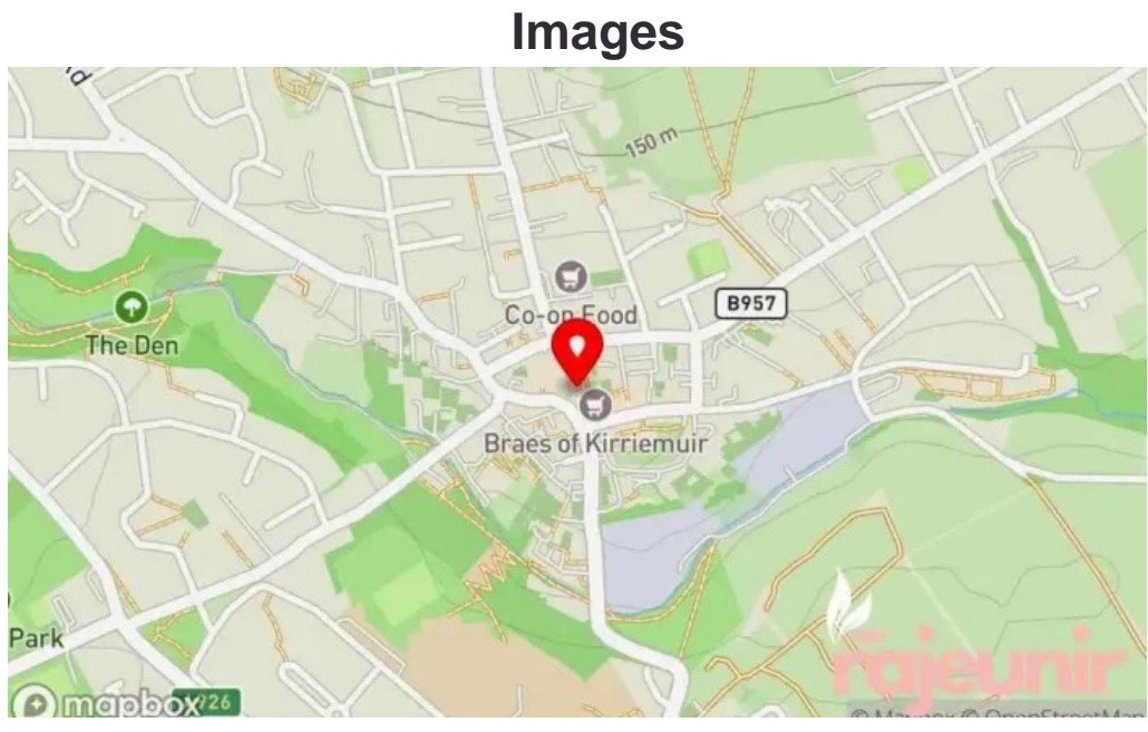
Boots pharmacy map

If you require to modify any data that you believe is not precise concerning this web, we urge you to deliver a message so that we will fix it at the earliest convenience. With anticipation thank you very much.