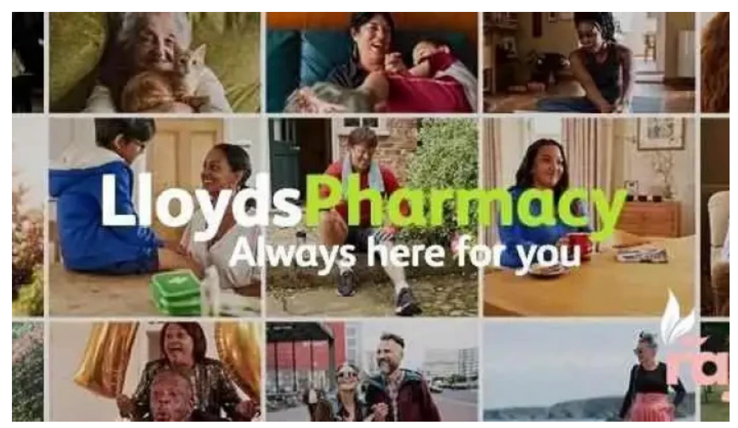
Pathhead pharmacy kirkcaldy