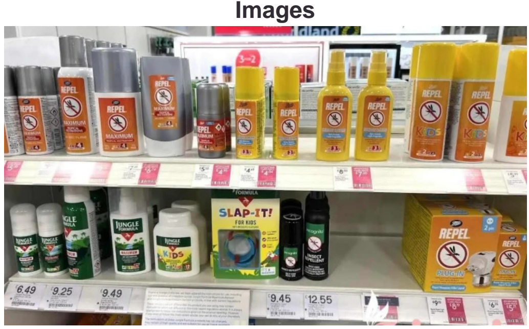
Boots pharmacy kilmarnock

If you wish to change any information that you believe is incorrect related to this portal, we urge you to send us a message so that we will adjust it quickly. Thank you in advance thanks.