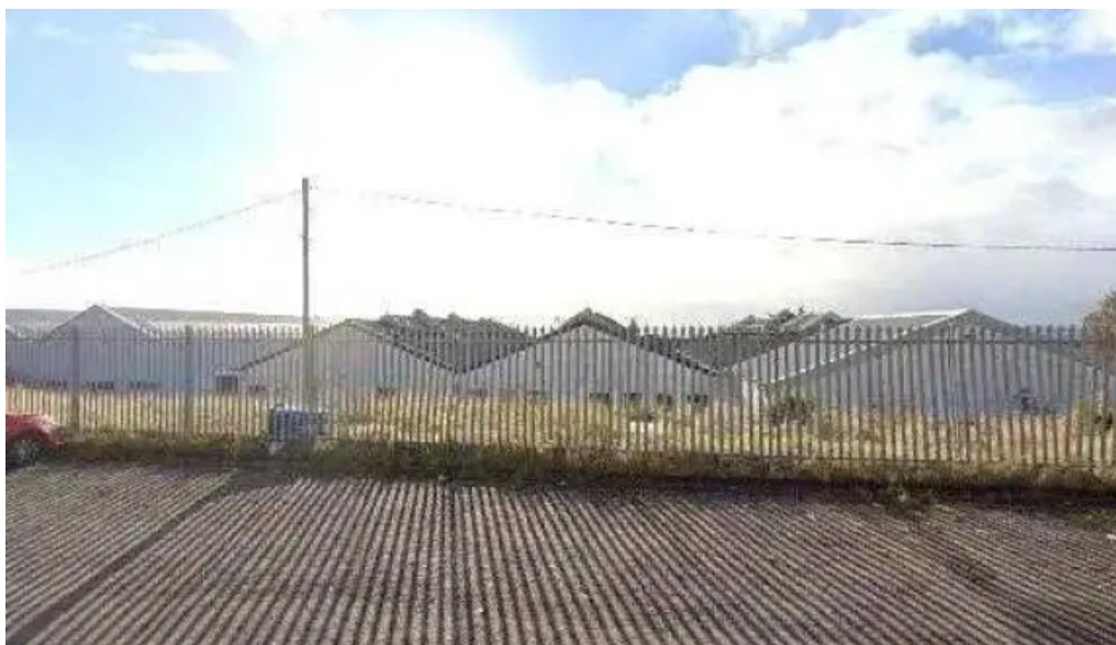
Ji Mei Dian Pu all