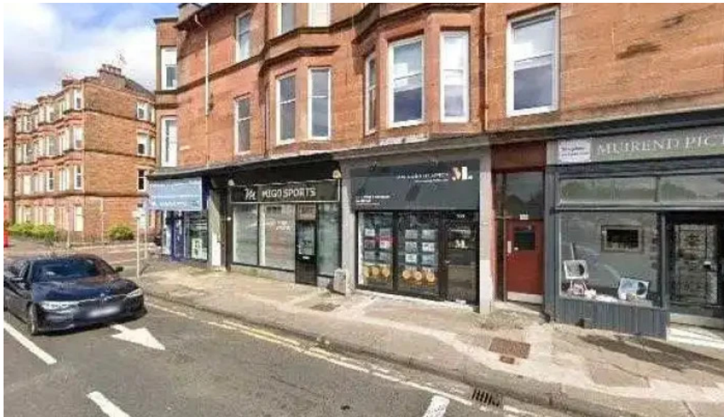
Muirend pharmacy street view 360deg