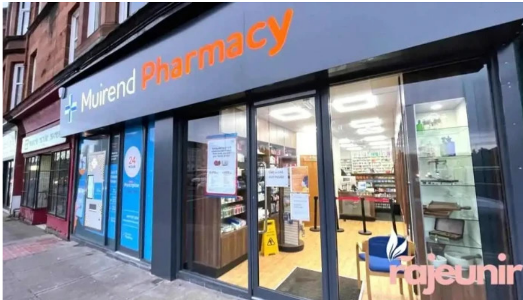
Muirend pharmacy all