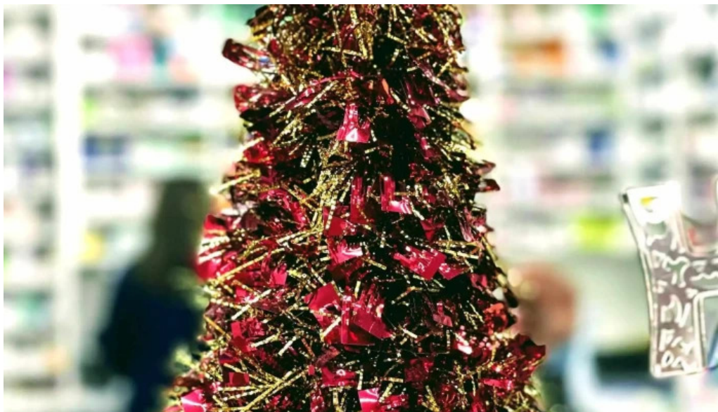
Muirend pharmacy by owner