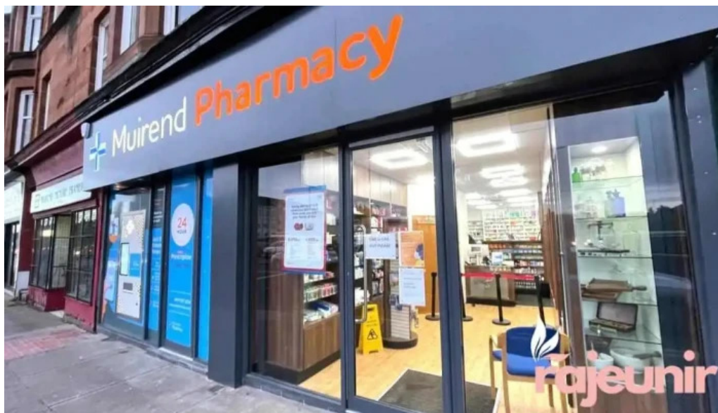
Muirend pharmacy glasgow