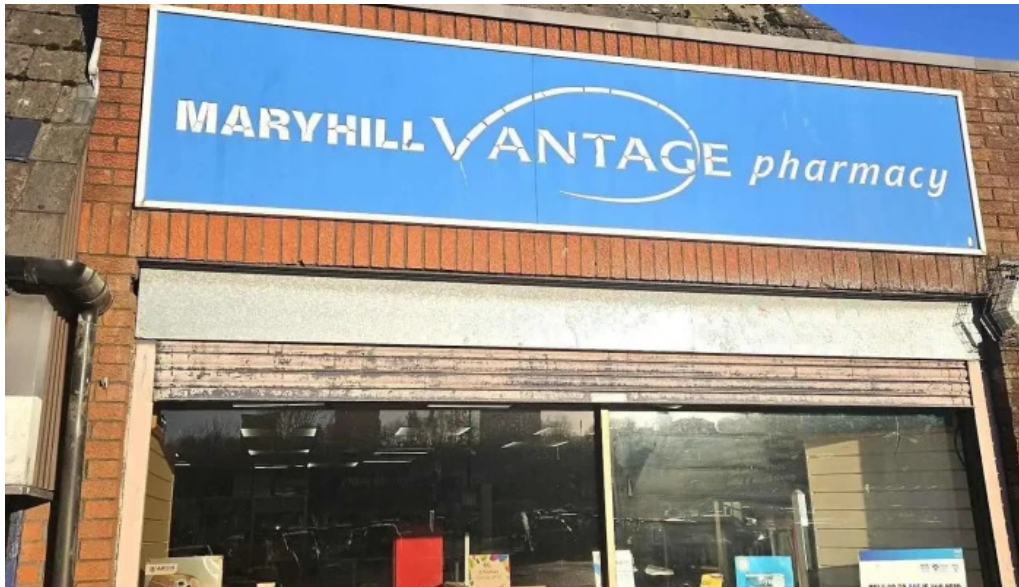
Maryhill pharmacy all