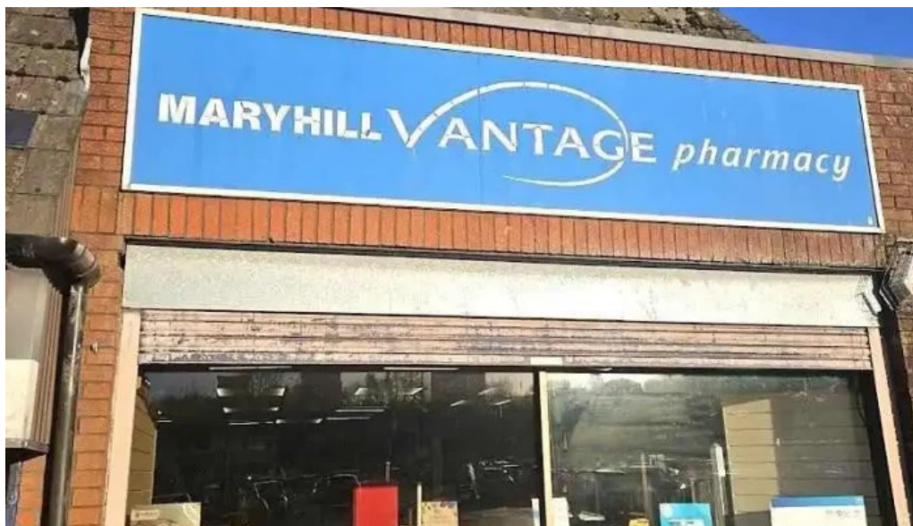
Maryhill pharmacy glasgow