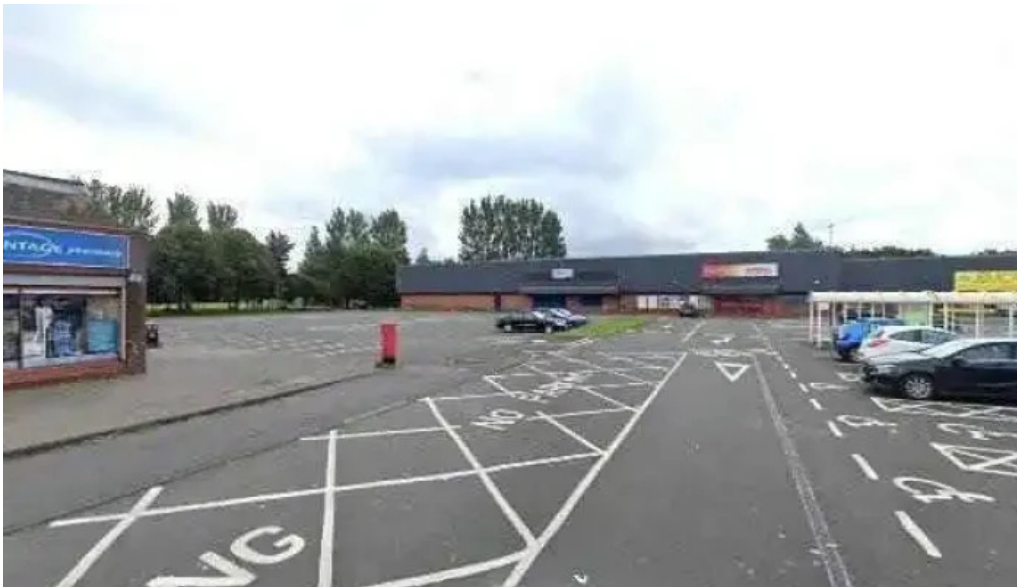
Maryhill pharmacy street view 360deg