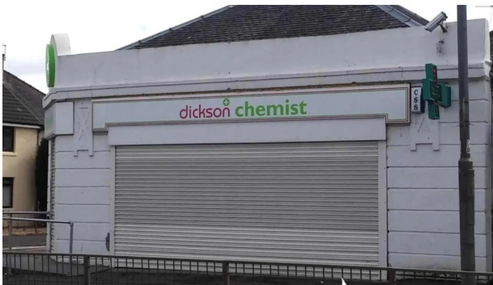
Dickson chemists all