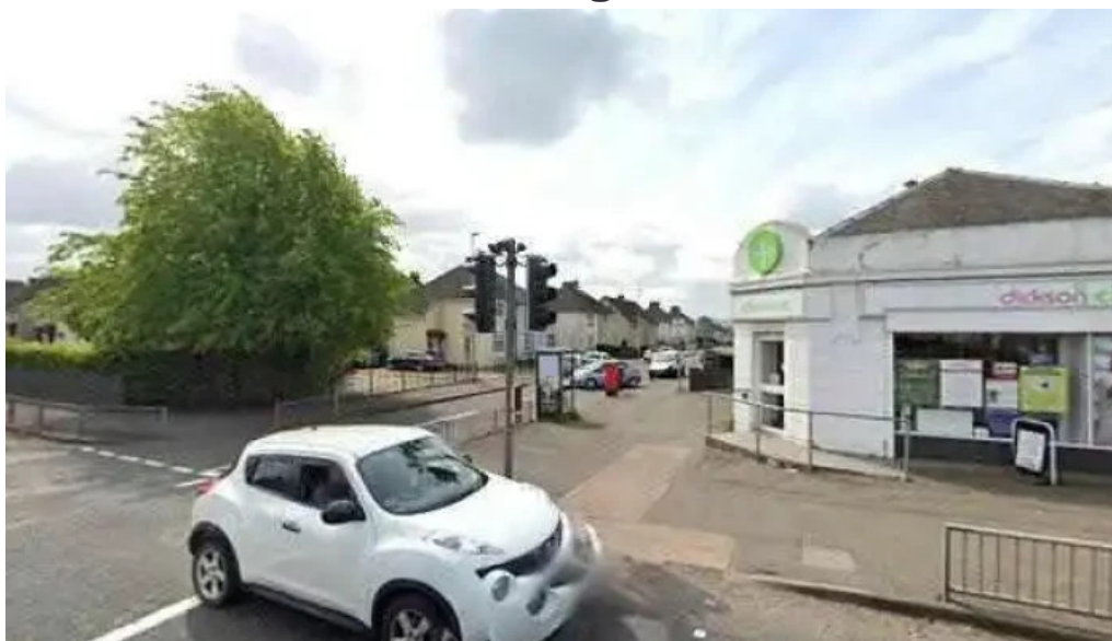
Dickson chemists street view 360deg