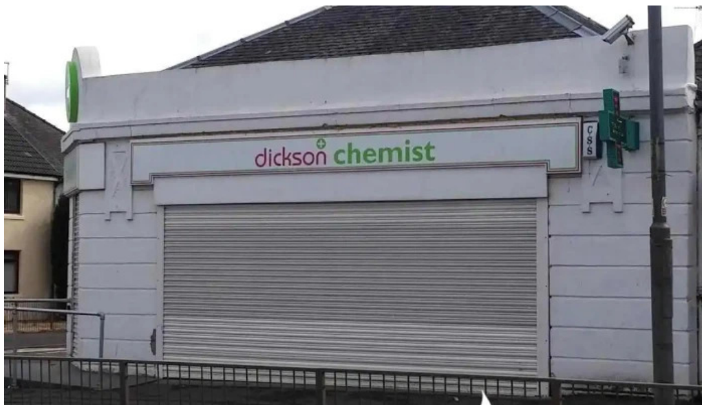
Dickson chemists glasgow