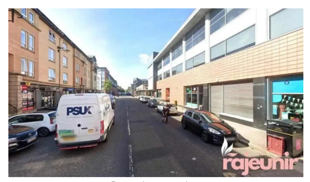
Boots pharmacy glasgow