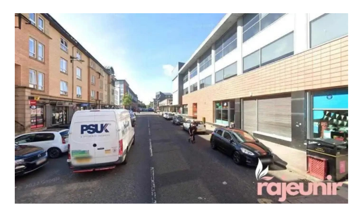
Pharmacy In Glasgow