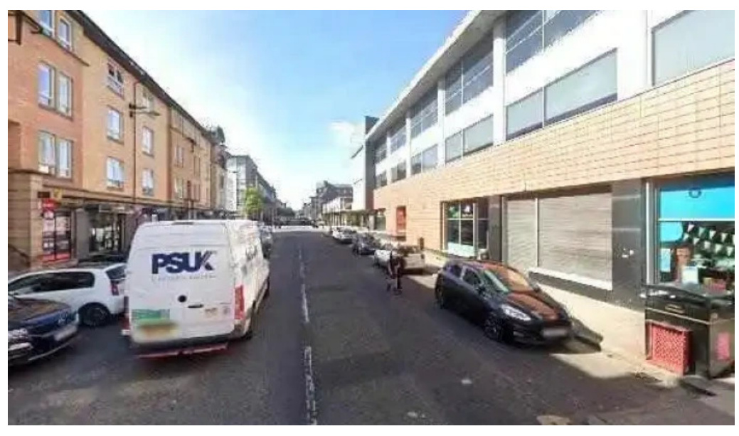
Boots pharmacy all