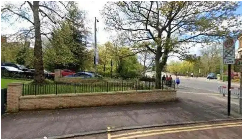
Boots pharmacy street view 360deg