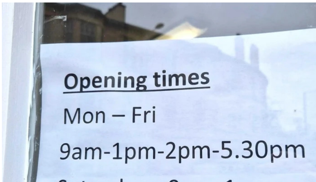
Boots pharmacy pharmacy