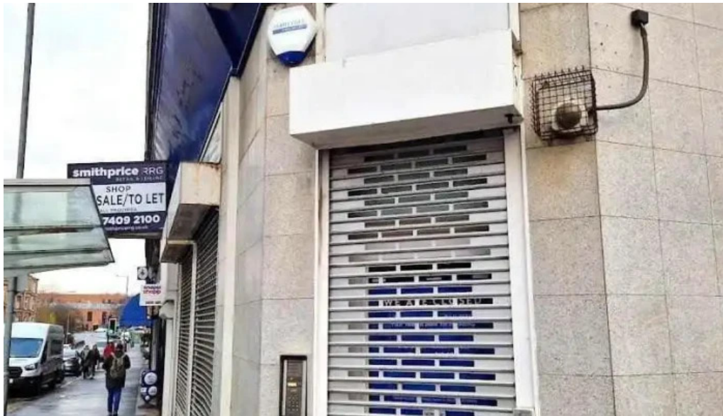
Boots pharmacy glasgow