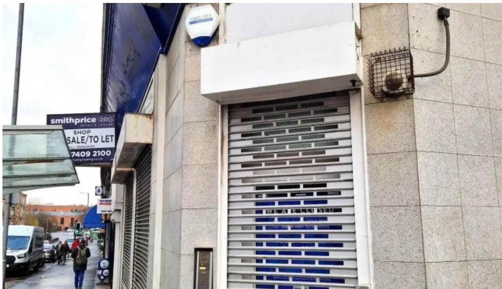
Boots pharmacy all