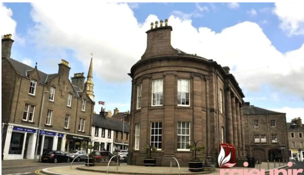
Boots pharmacy forfar