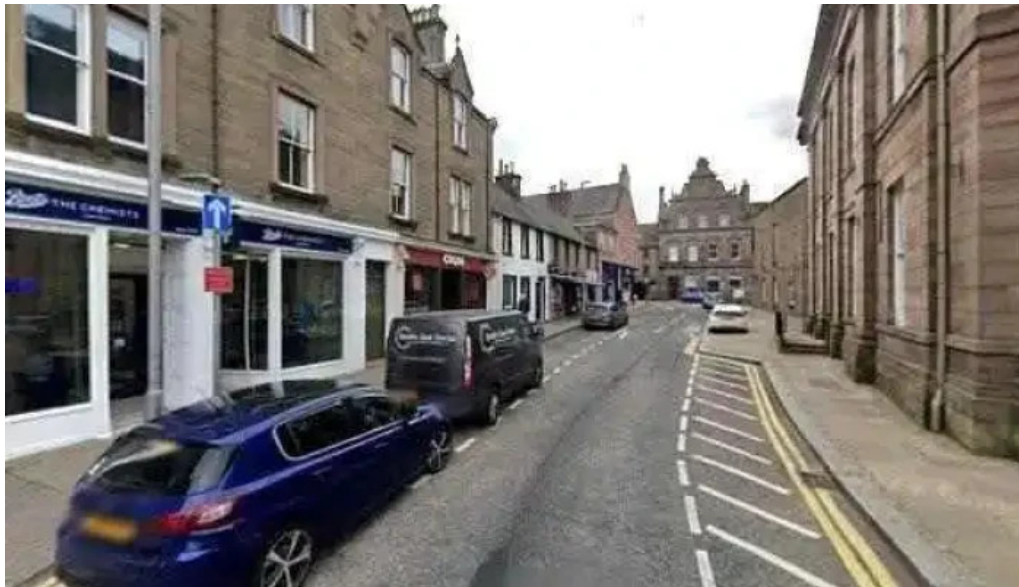
Boots pharmacy street view 360deg