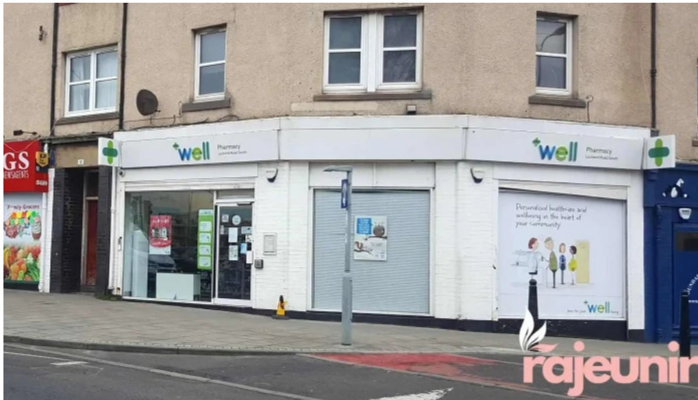
Well pharmacy edinburgh