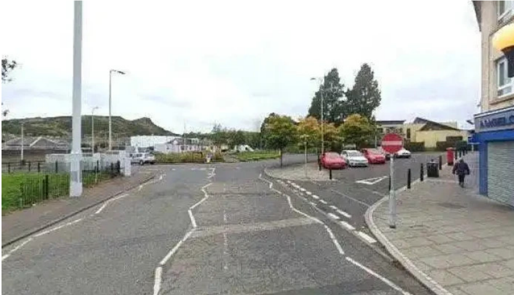
Well pharmacy street view 360deg