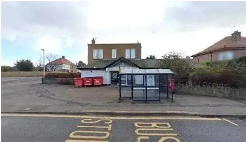
Well pharmacy street view 360deg