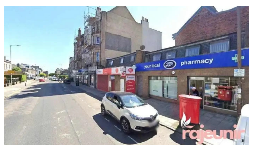
Boots pharmacy edinburgh