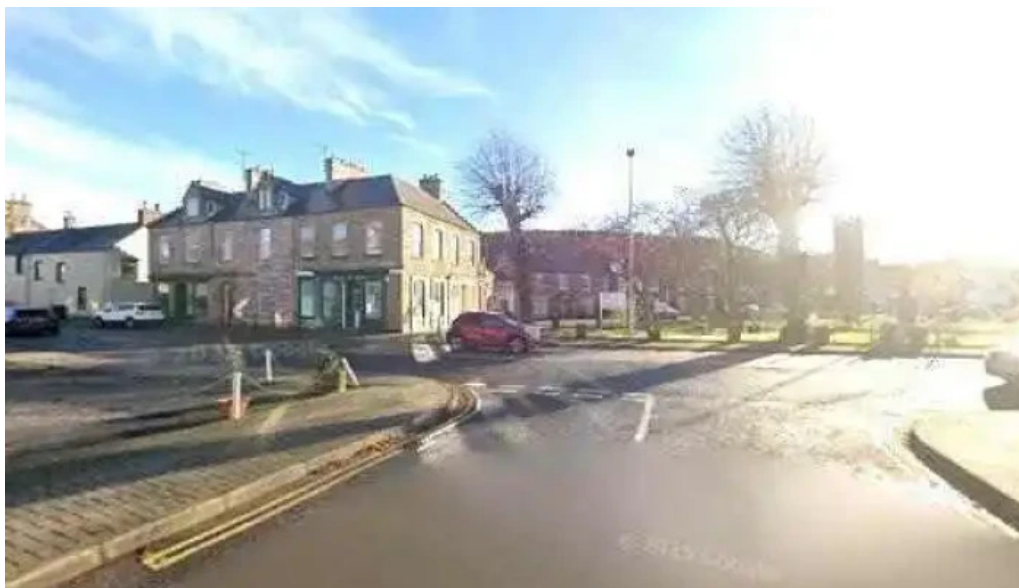
Earlston pharmacy all