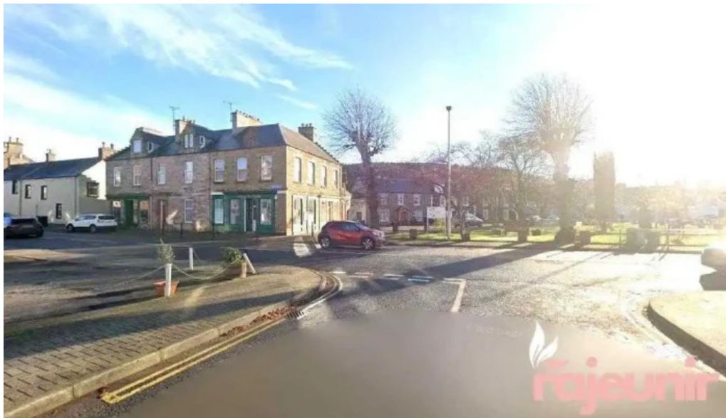
Earlston pharmacy earlston