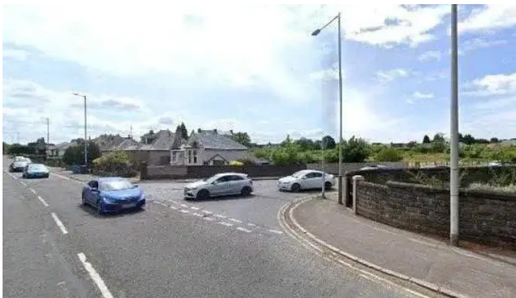
Boots pharmacy all