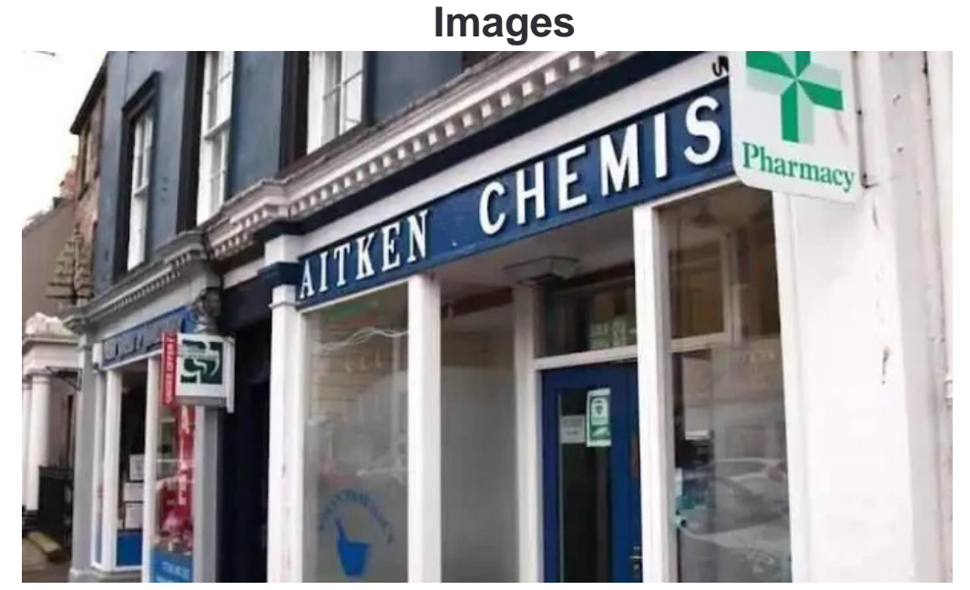
Aitken pharmacy alphega pharmacy dunbar

If you wish to update any element that you think is incorrect about this portal, we kindly request send us a message so that we will handle it quickly. Thank you in advance thanks.