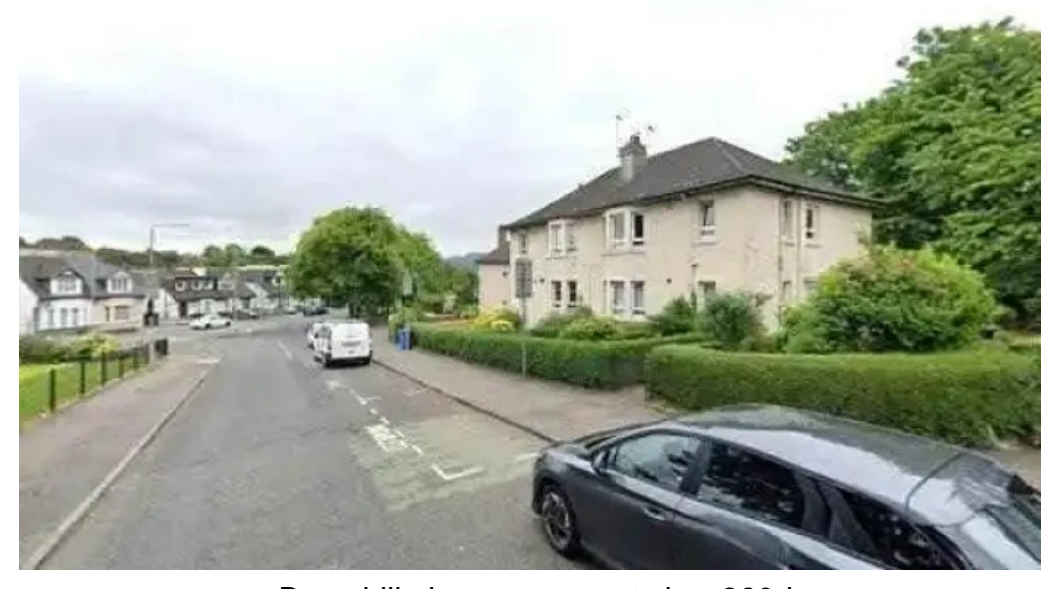
Brucehill pharmacy street view 360deg