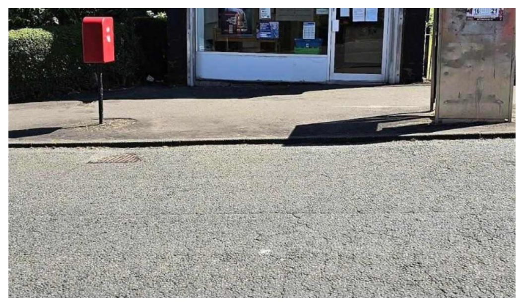
Brucehill pharmacy all