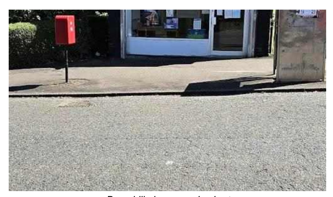
Brucehill pharmacy dumbarton