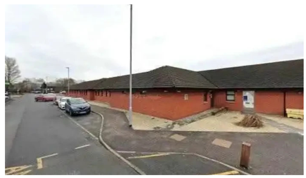
Coatbridge dispensary Itd all