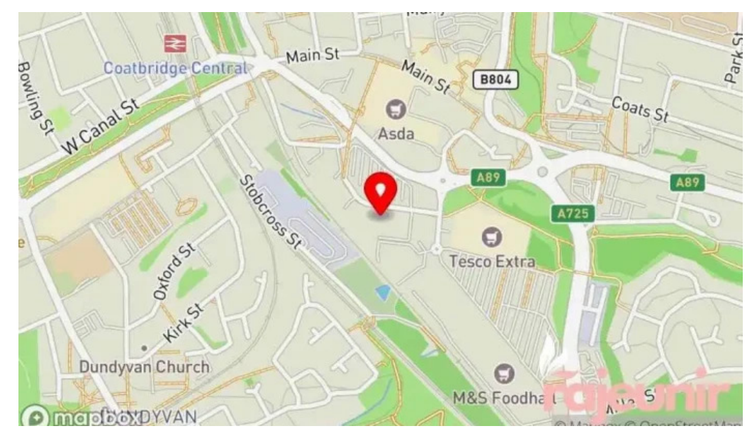
Coatbridge dispensary Itd map