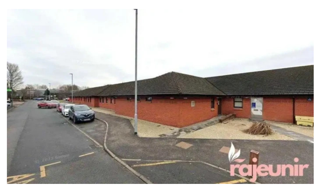
Coatbridge dispensary Itd coatbridge