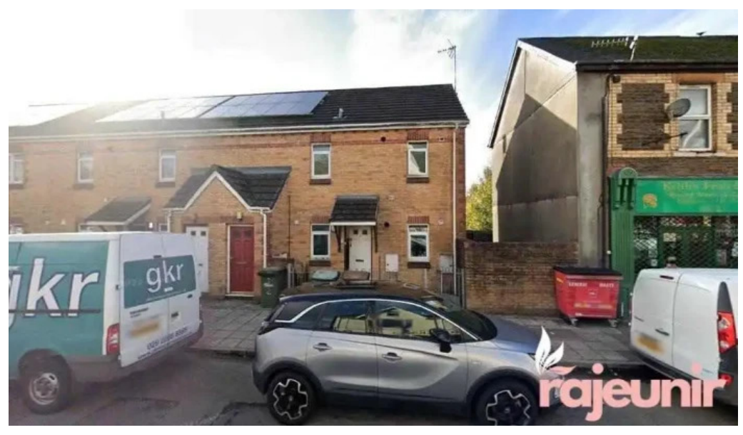
Vida rogers pharmacy ltd alphega pharmacy blackwood