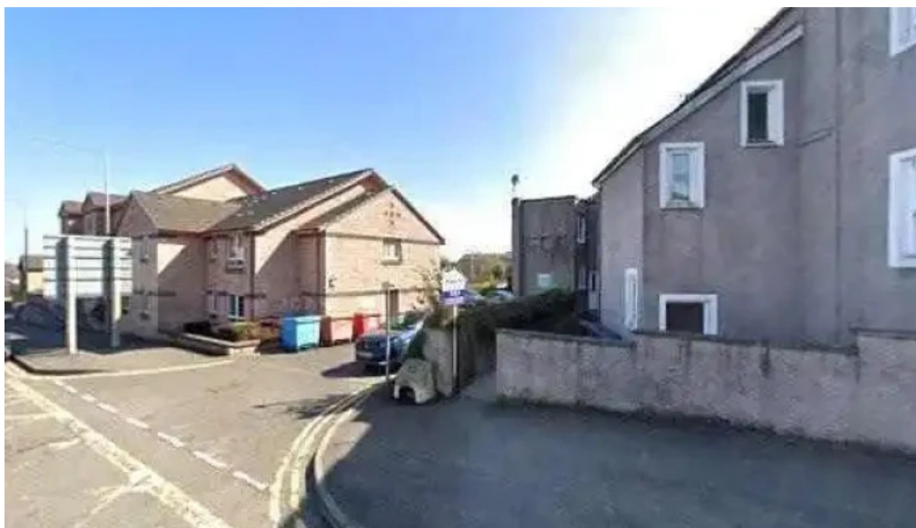
Md green pharmacy armadale bathgate all