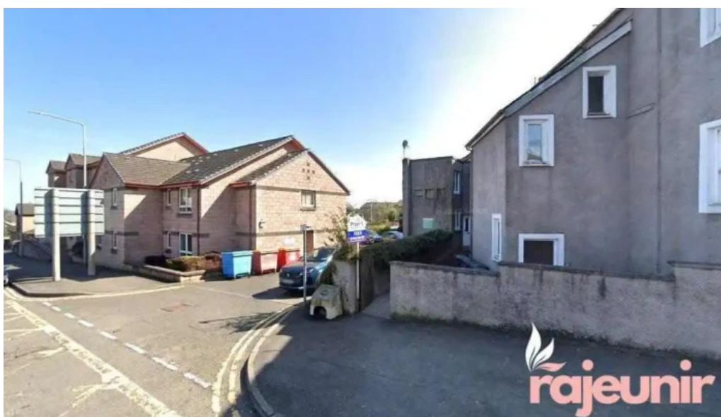
M d green pharmacy armadale bathgate bathgate