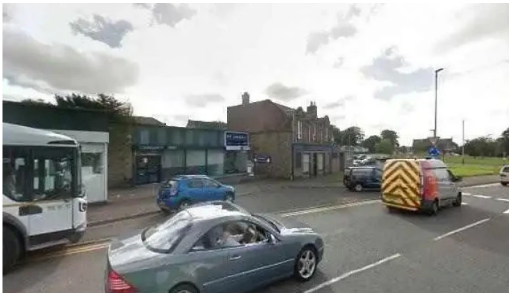
Well pharmacy street view 360deg