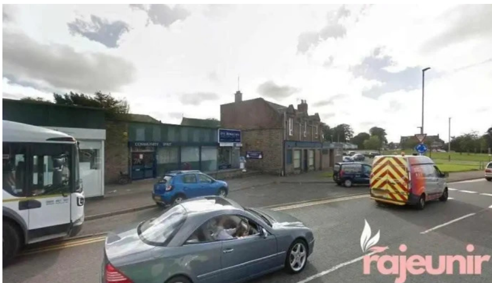
Well pharmacy arbroath