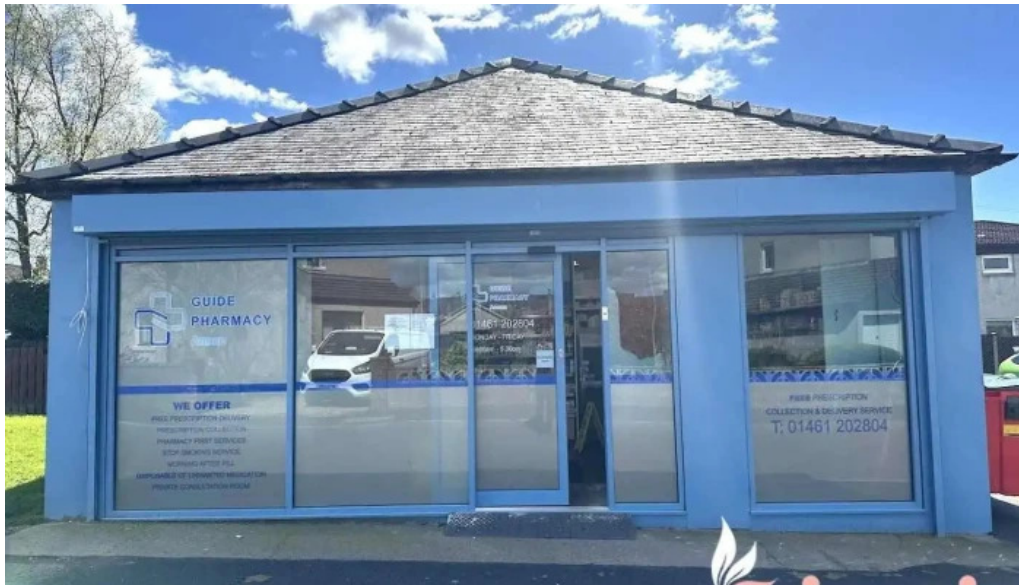
Guide pharmacy annan annan