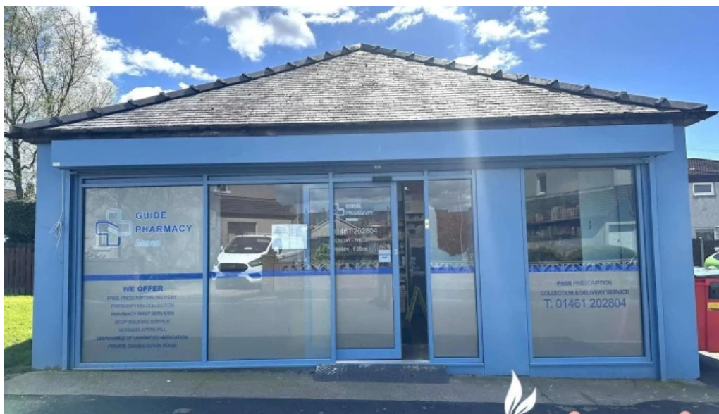
Guide pharmacy annan by owner