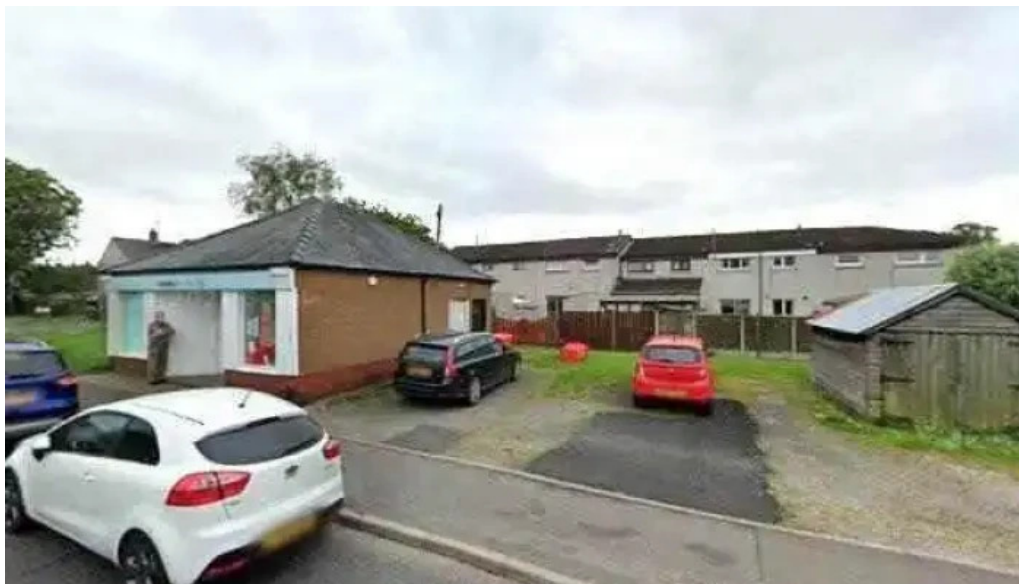
Guide pharmacy annan street view 360deg