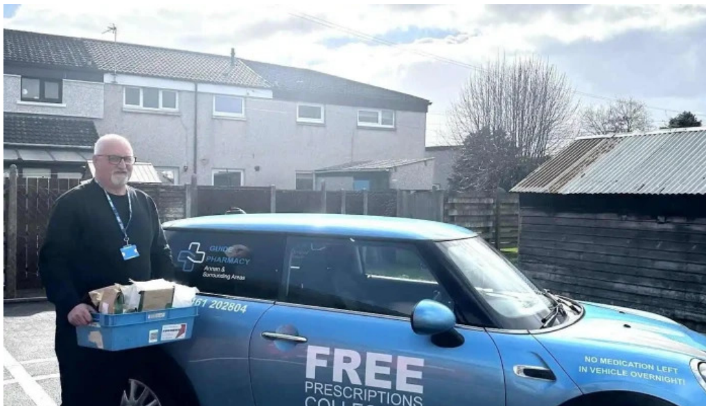
Guide pharmacy annan all