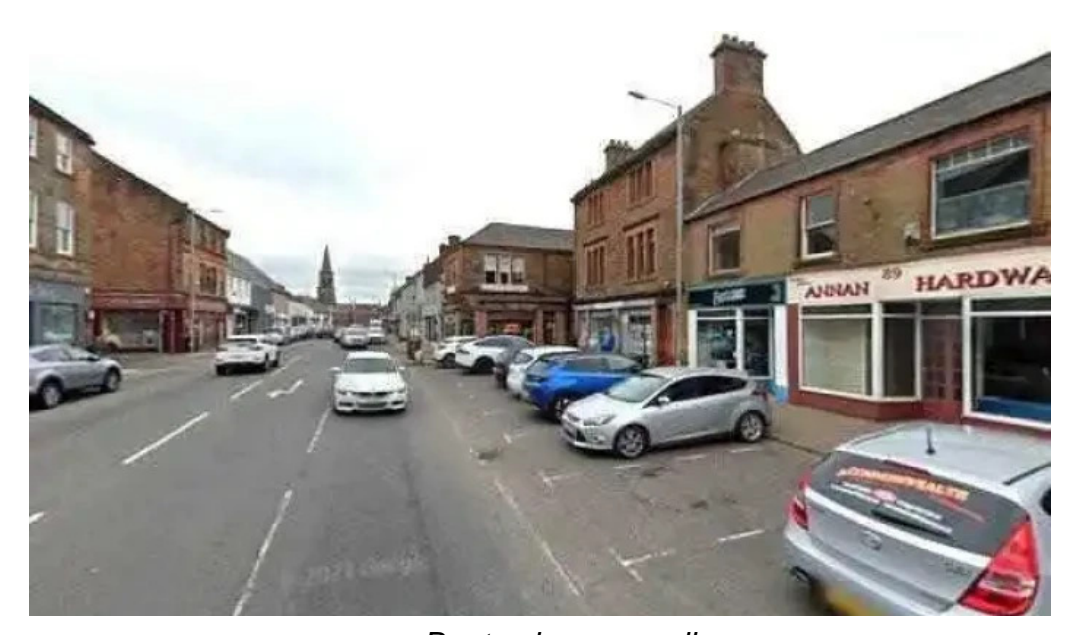
Boots pharmacy all