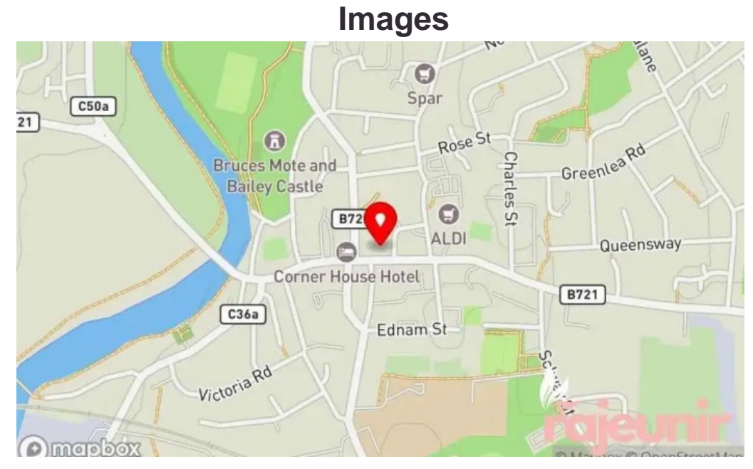
Boots pharmacy map

If you need to modify any detail that you consider is not accurate related to this web, please send us a message so that we will adjust it at the earliest convenience. In advance thanks for your cooperation.