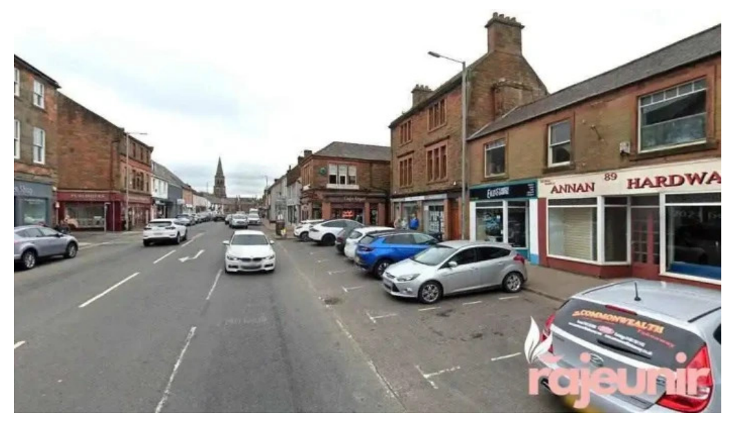
Boots pharmacy annan