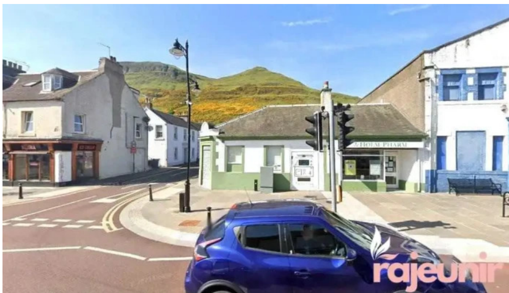
Holm pharm ltd alva