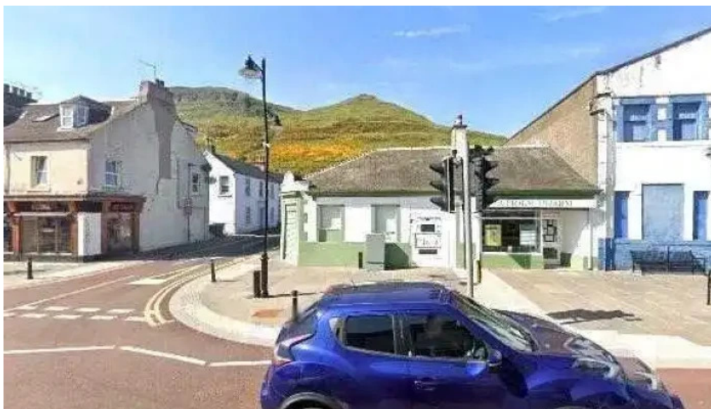
Holm pharm ltd all