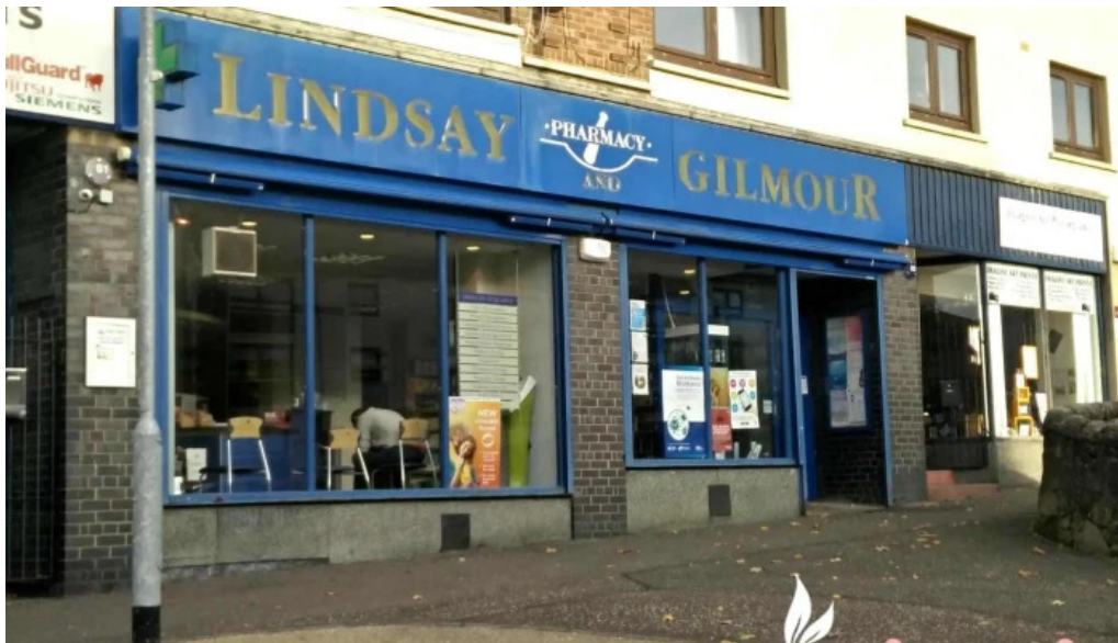
Lindsay gilmour pharmacy sauchie all