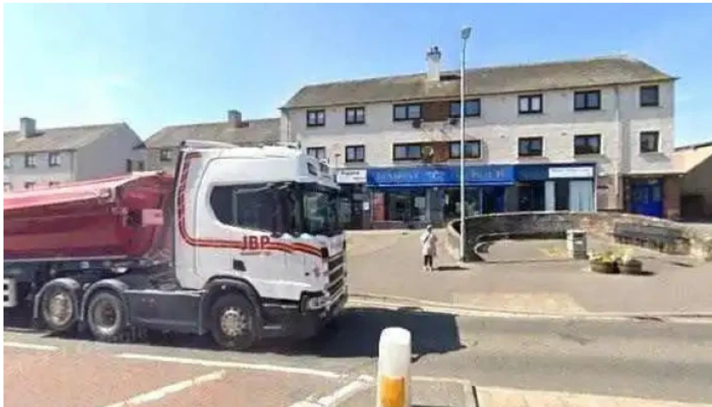
Lindsay gilmour pharmacy sauchie street view 360deg