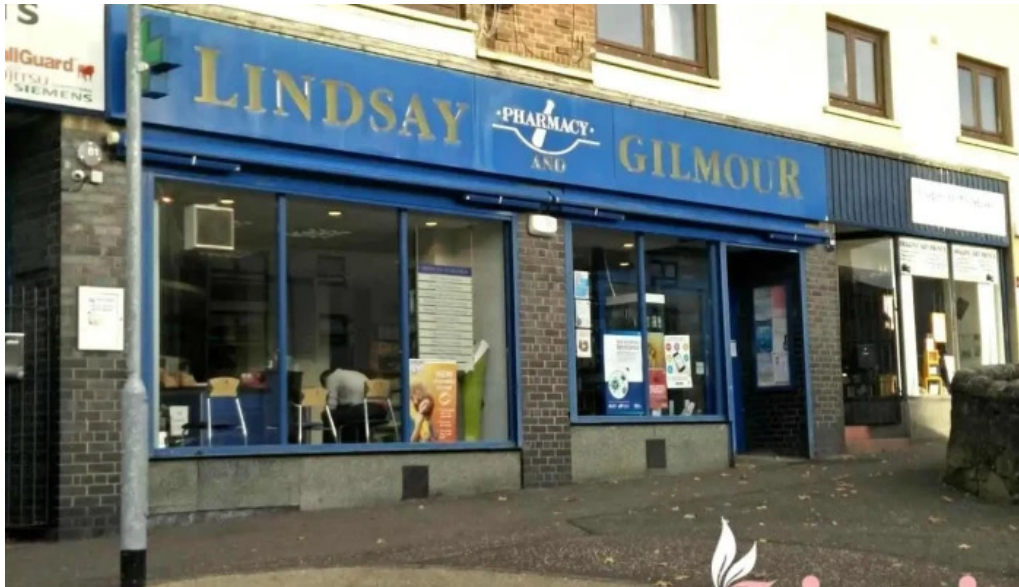
Lindsay gilmour pharmacy sauchie alloa