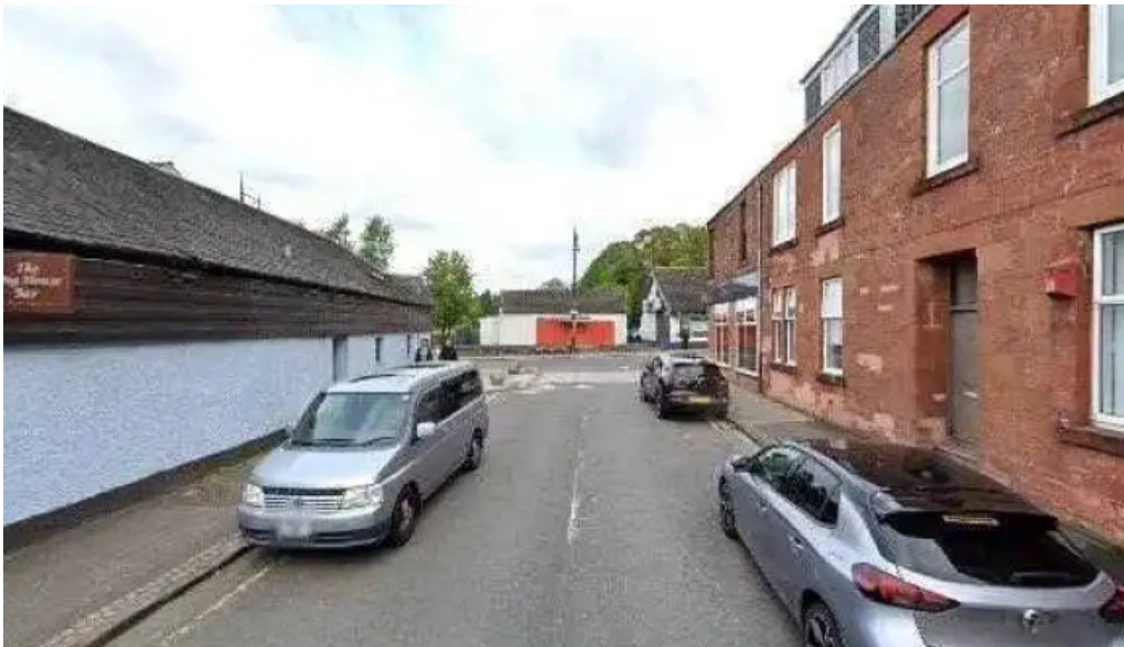
Well pharmacy street view 360deg