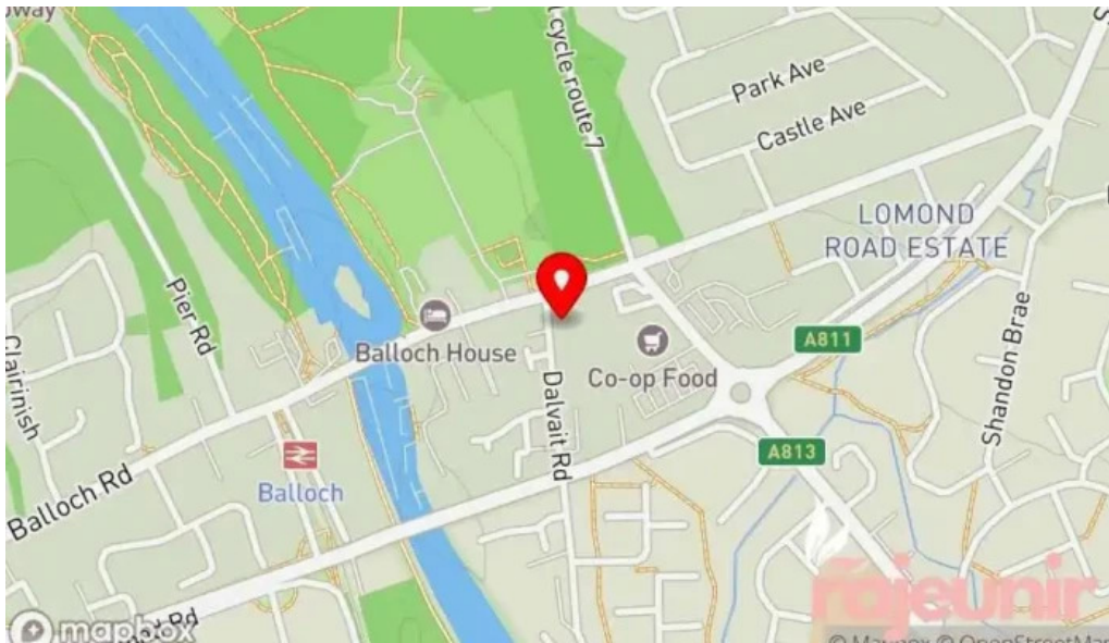
Well pharmacy map