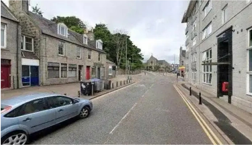
Ferryhill pharmacy street view 360deg