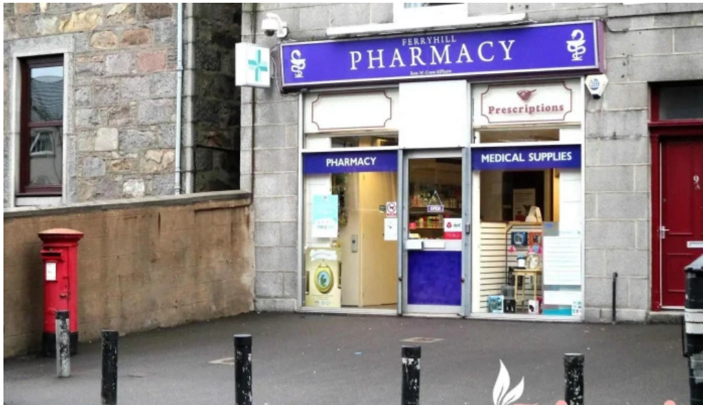
Ferryhill pharmacy all