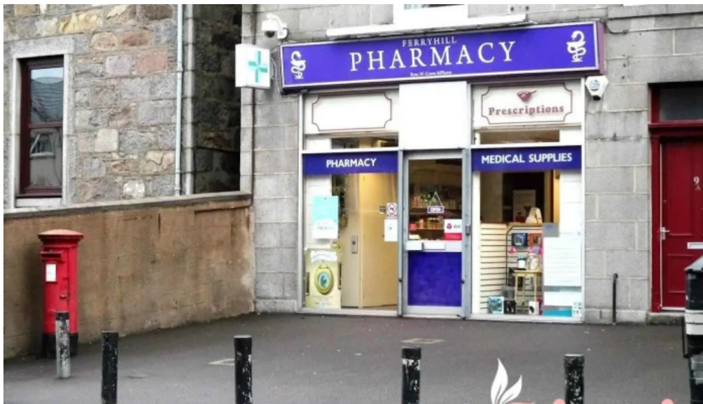
Ferryhill pharmacy aberdeen