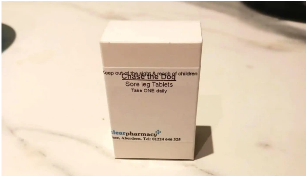
Clear pharmacy aberdeen aberdeen