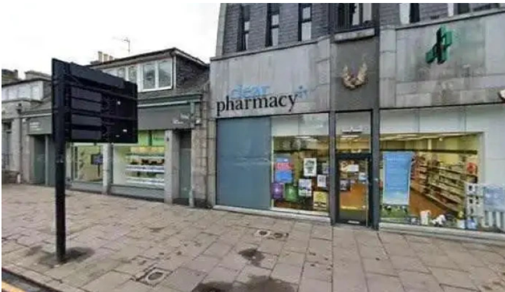
Clear pharmacy aberdeen street view 360deg