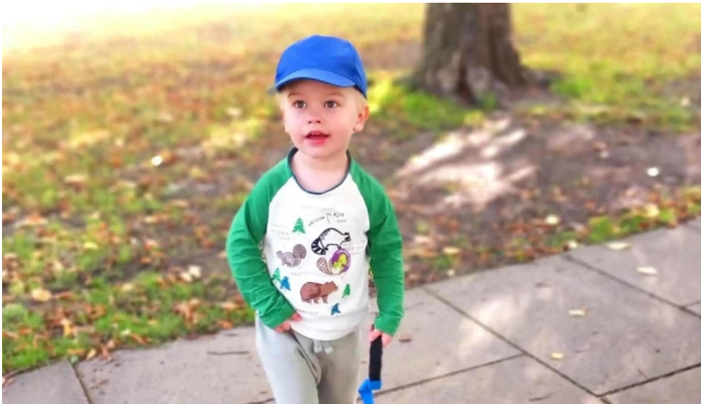
Clear pharmacy aberdeen pharmacy