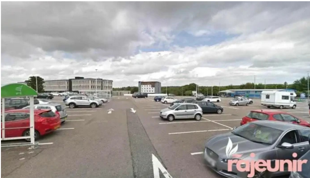
Boots pharmacy aberdeen