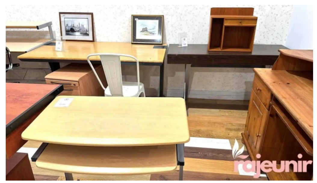
Blythswood care dingwall